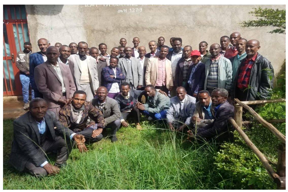
Five Clasters Conference Hadiya and Kenbata Zone Hadero city (June 1-3, 2023