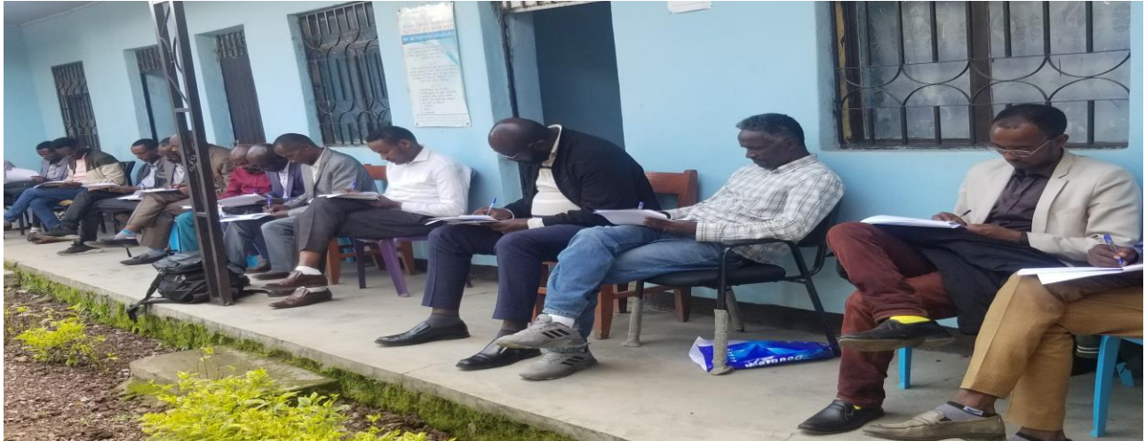
The 12 respondents Pastors and evangelists who

The scope of the impact assessment covers 12 ministers, 4 pastors and 8 Evangelists from 11 regions and 1 Evangelism expansion fellowships of Ethiopia Guenet church. The time span of the assessment is between June 2022 – May 2023. The impact assessment was done according to the form, and questionnaires given by CTN.