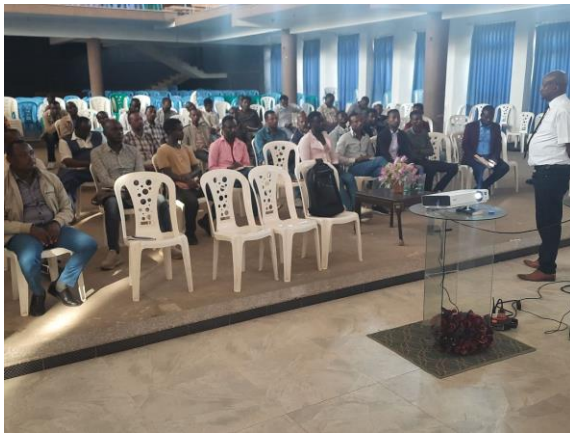
Figure 3: EGC 8 EGC Regional Facilitators follow-up and Discussion time with the Champion