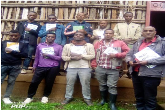
Figure 15: EGC Melega Region study group