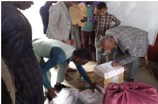
Figure 17: Two regions Kefa Shaka and south west Material distribution