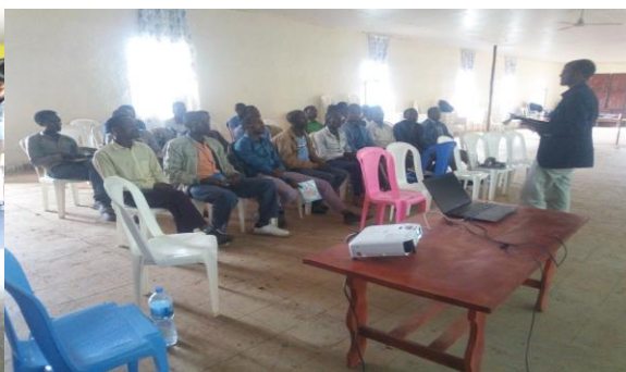
Figure 6: EGC Kefa Sheka region Facilitators training