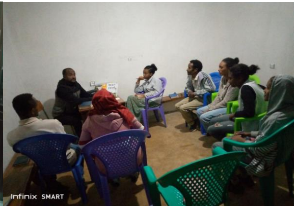
Figure 4: EGC North West Region study group at Bahir Dar Guenet