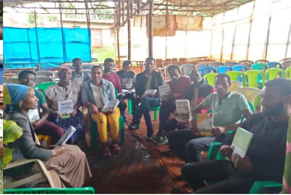
Figure 14: Kafa Shaka cluster at their monthly meeting