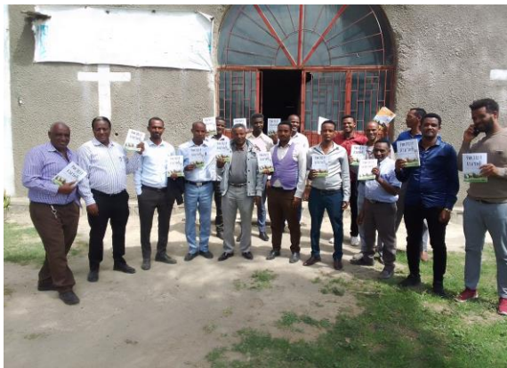
Figure 3 EGC Central Ethiopia Region monthly cluster Meeting