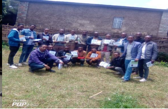
Figure 2 monthly cluster meeting EGC Aroresa Region