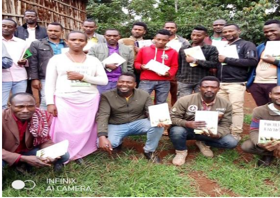
Figure 13: Bule Hora Guent cluster trainees