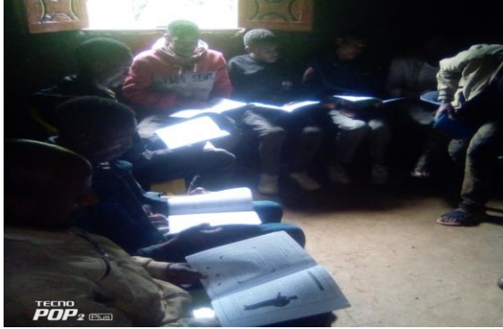
Figure 1 monthly Cluster meeting in EGC Wendo Region

Very few among thousands of monthly cluster meetings, Facilitators training, material distribution, and other activities of PEN from EGC photo gallery in different parts of ECG regions.