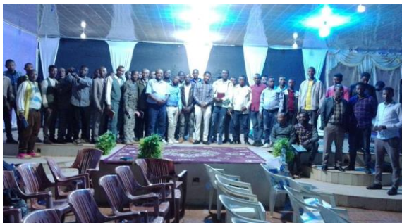
Figure 11: EGC south East Region facilitator's training and Material distribution