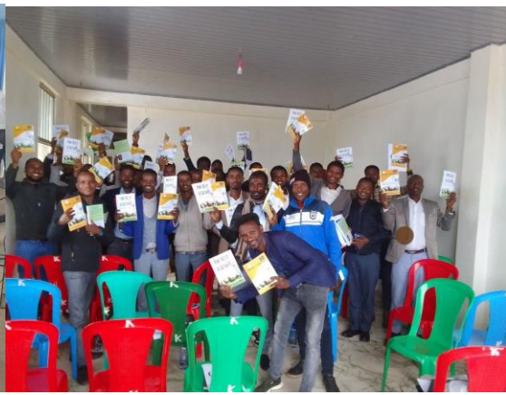
Figure 8: EGC West Shoa Region Two study groups in their monthly cluster meeting