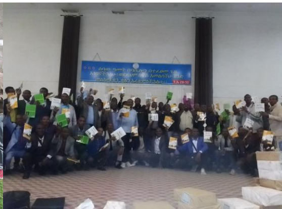
Figure 1 :8 Region Facilitators Training and distribution of material