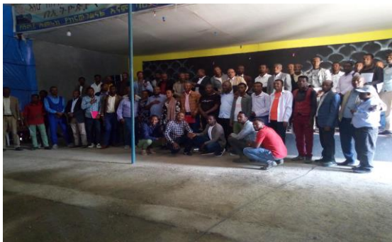
Figure 2: EGC Central Ethiopia Facilitators training and Material distribution