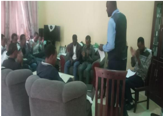
Figure 9 : Hawasa Guenet Study group