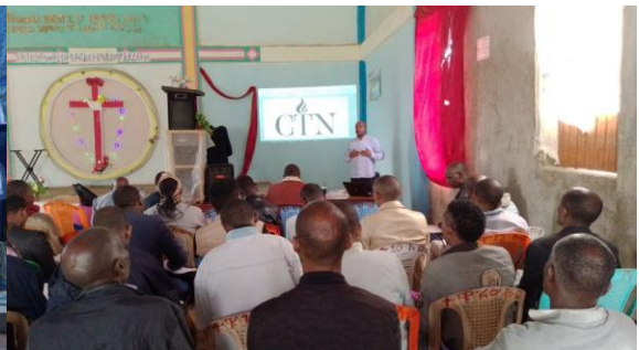
Figure 5 : EGC Aleta Wendo region Facilitators training