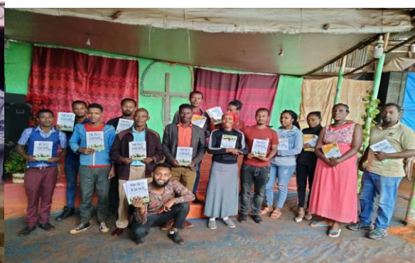
Figure16: EGC south East region Dila Guenet trainees at Their monthly meeting